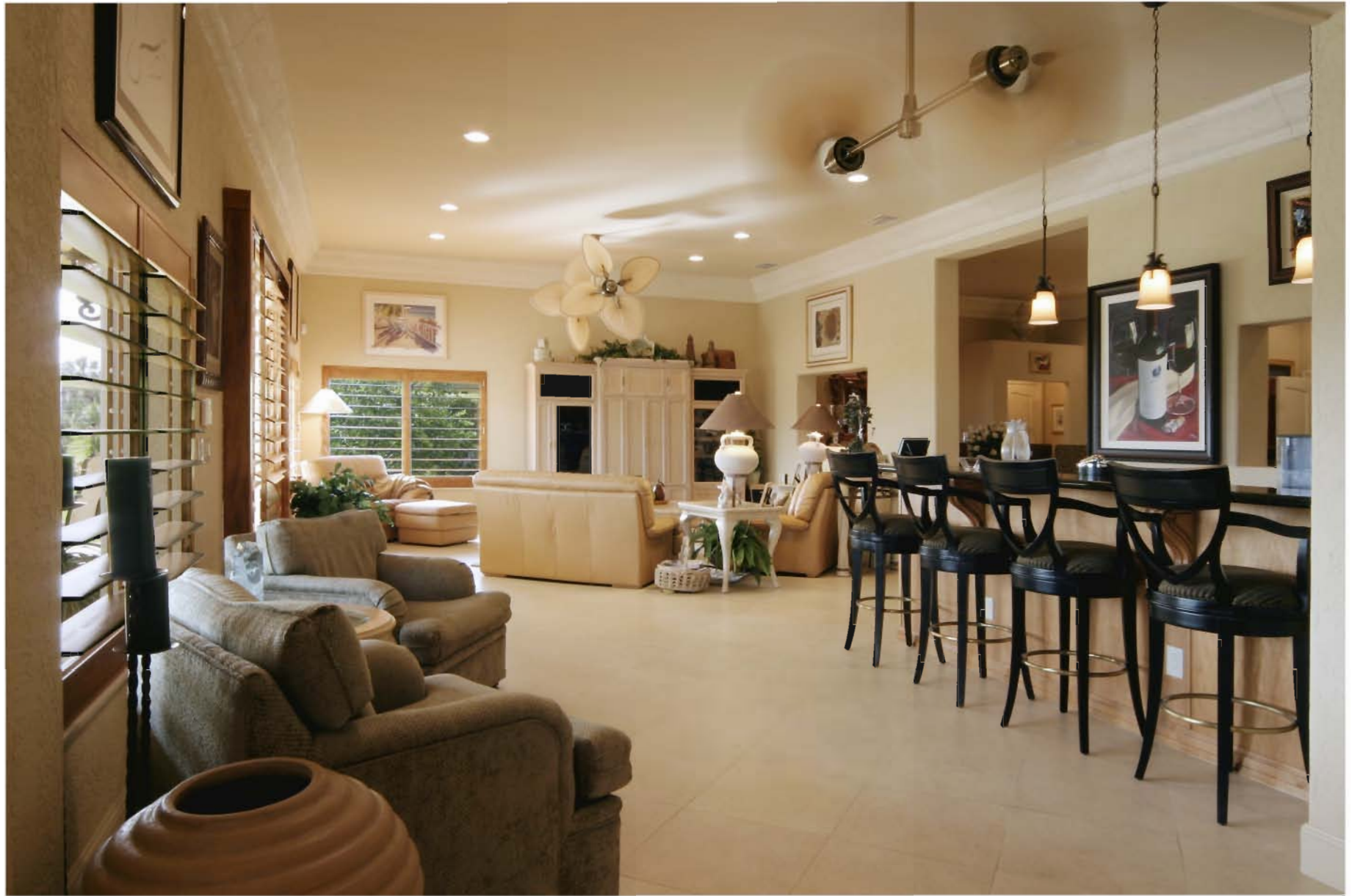
Masterpiece Country Club Home Stuart, Florida